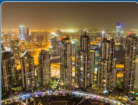
Executive Tower Business Bay Dubai