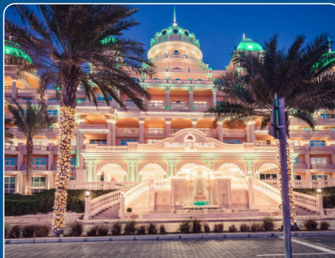
Kempinski Hotel, Palm Island, Dubai