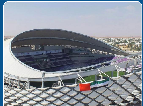
Hazza Bin Zayed- Stadium, Dubai