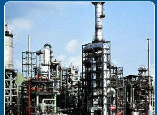
Paradip Refinery - India