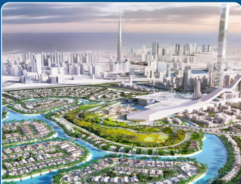
MBR City, District-1, Dubai